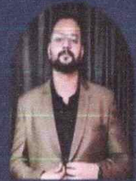
UUC ANESH DM